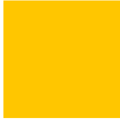
Yellow R/S MIXE-2042