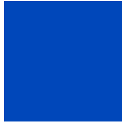
Blue R/S MIXE-5003