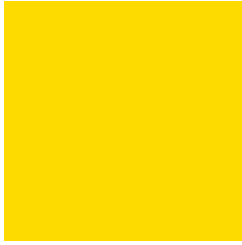
Yellow G/S MIXE-2002