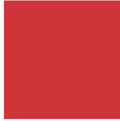
Red Y/S MIXE-3002